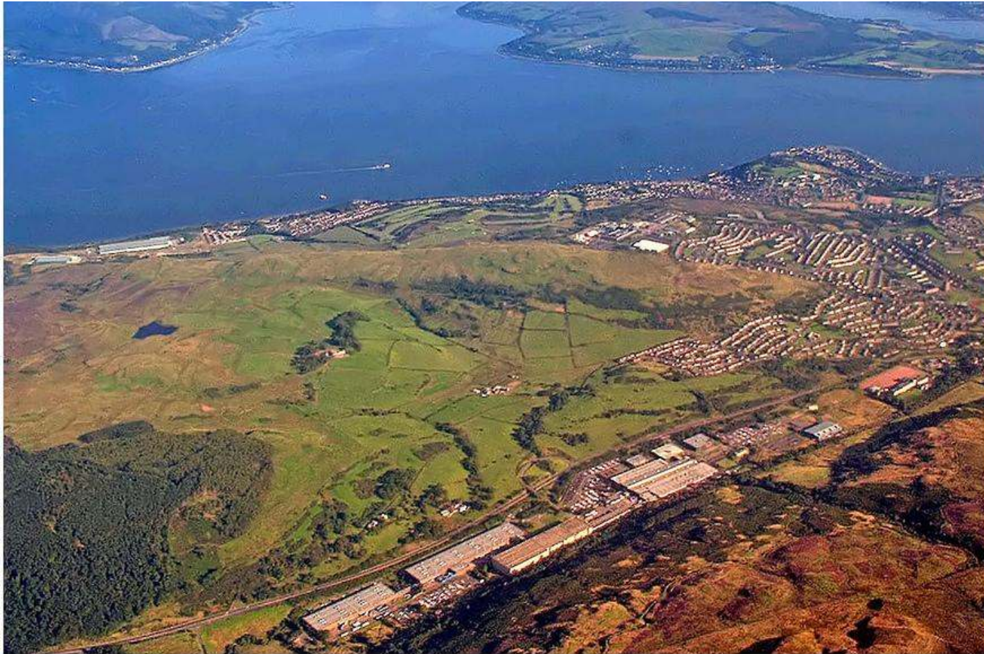
IBM United Kingdom , Greenock