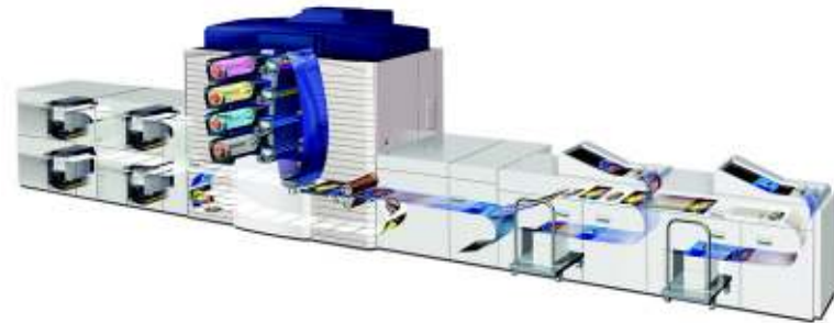
Xerox IGen3 , Digital Press