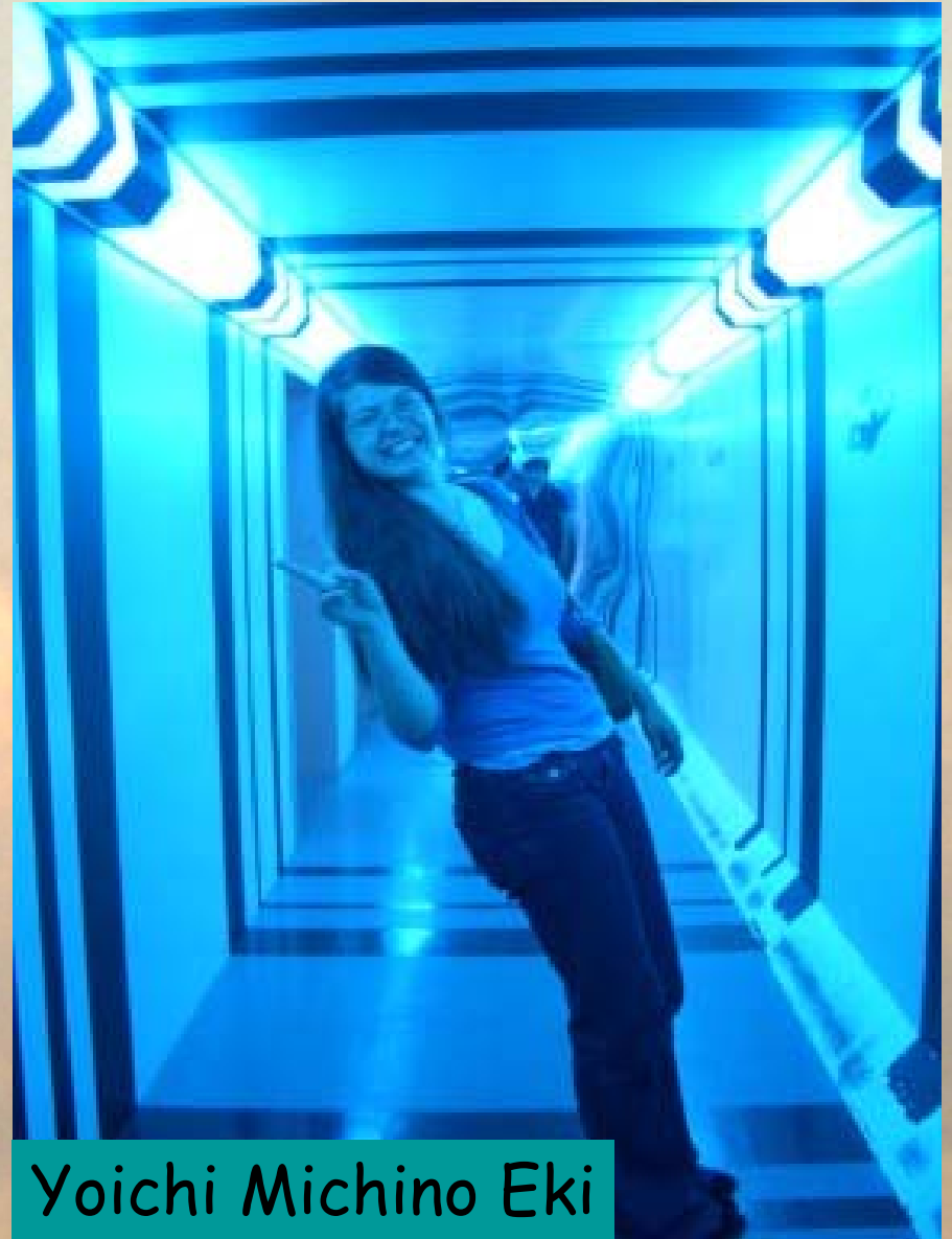
Yoichi Michino Eki