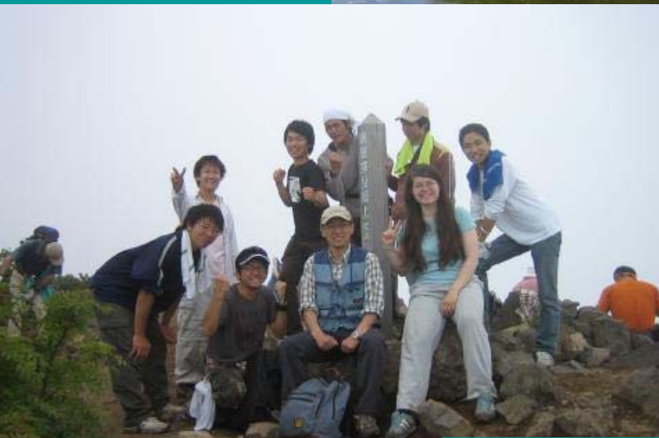
Minami shokan dake