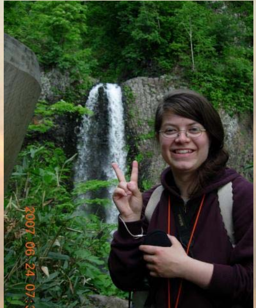
White Dragon waterfall